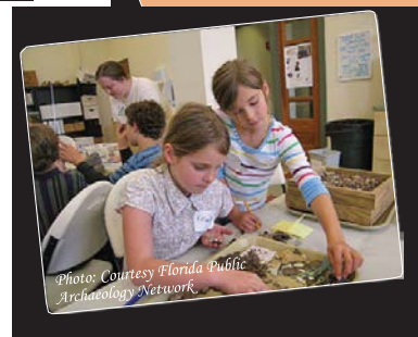
Archaeologists clean, sort, and classify the artifacts they find. Students can volunteer to help!