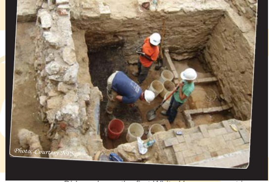
Did you know the first White House was not in Washington, D.C.? Here archaeologists are excavating the site of the Philadelphia house where George Washington lived. The President's household included nine enslaved Africans and 15 indentured servants.

Archaeologists use many methods to study the past! How many can you find in the puzzle? Check your answers on our web page! http://www.saa.org/publicftp/PUBLIC/fun/puzzle.html