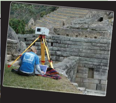
Tools of the Trade: Left—Archaeologists use screens to sift soil and find artifacts. Right—Laser scanners help archaeologists create 3-D images of sites. This is Machu Picchu in Peru.