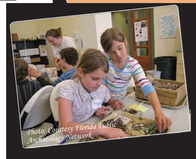
Archaeologists clean, sort, and classify the artifacts they find. Students can volunteer to help!