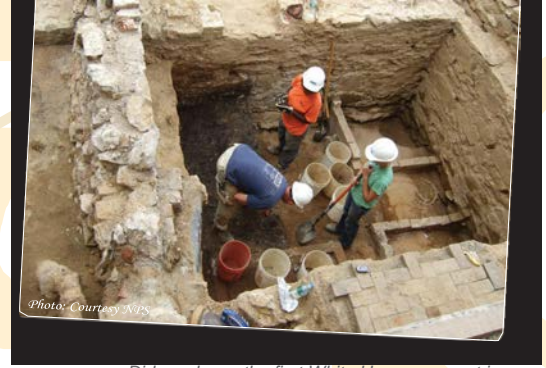
Did you know the first White House was not in Washington, D.C.? Here archaeologists are excavating the site of the Philadelphia house where George Washington lived. The President's household included nine enslaved Africans and 15 indentured servants.

Archaeologists use many methods to study the past! How many can you find in the puzzle? Check your answers on our web page! http://www.saa.org/publicftp/PUBLIC/fun/puzzle.html